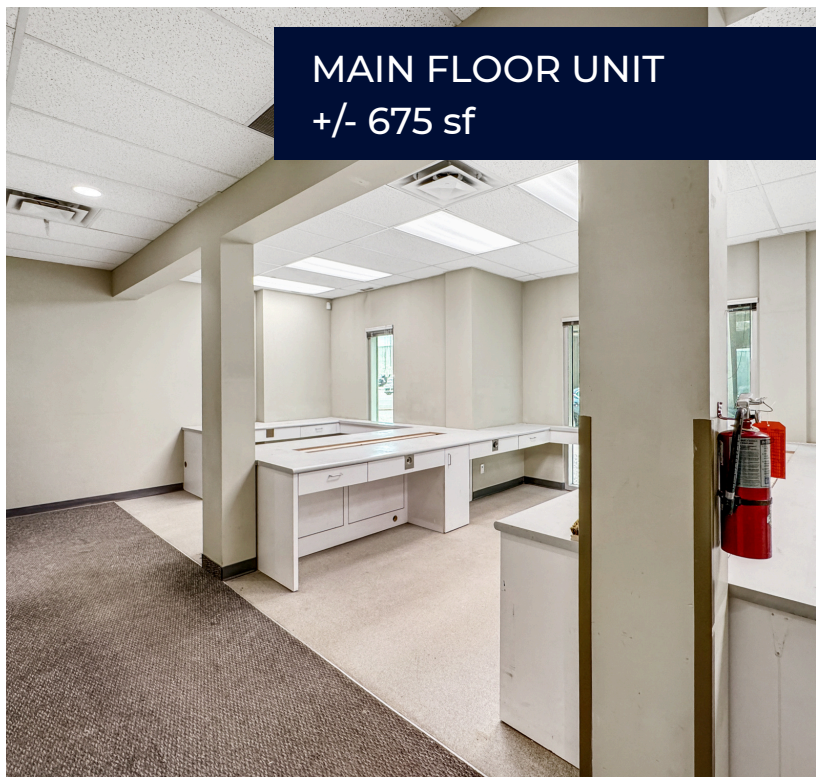
MAIN FLOOR UNIT +/- 675 sf